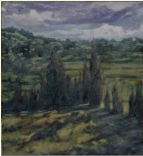
'Along Coolah Road'

Cost: £30/day per student plus £15 for materials to be supplied by the tutor. Alternatively, students can provide their own materials as per the list provided.