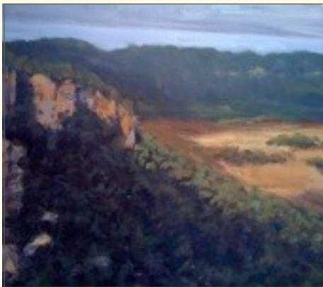
'Into the Shadows'