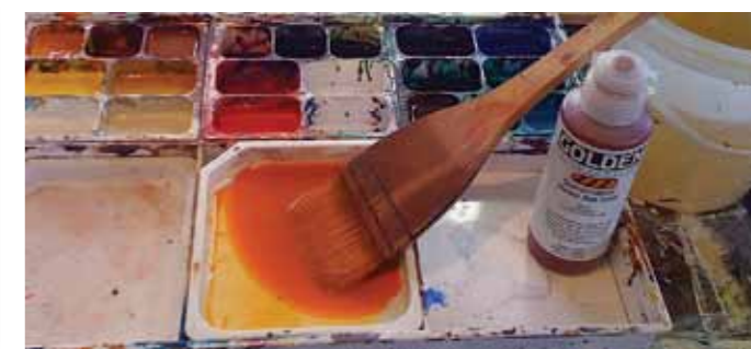
Mixing up a washy Quinacridone Nickel Azo Gold and Burnt Sienna to tone my canvas and give it some warm underglow.