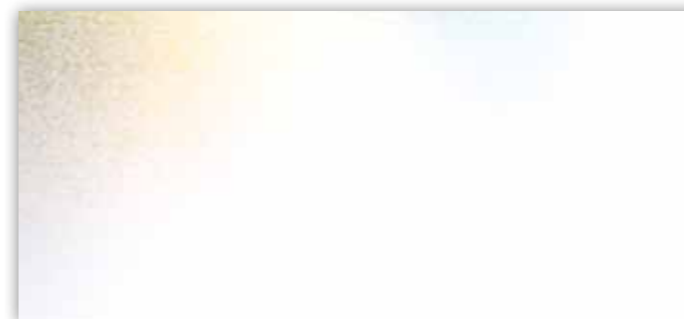
In the beginning there was a white canvas - all 33 x 78" of it!