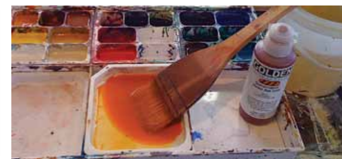
Mixing up a washy Quinacridone Nickel Azo Gold and Burnt Sienna to tone my canvas and give it some warm underglow.