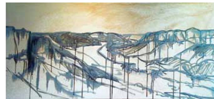
I toned with a Burnt Sienna light wash, then drew with a Phthalo Blue and Burnt Sienna skeleton.