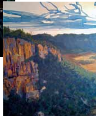
Working into the cliff area

As I further develop my painting, I build up layers of thicker paint and often add some Golden gels or pastes to create more body and impasto layers. In this way, I can satisfy my need to work in the water media and have the best of both worlds - from glowing transparent washes to opaque and textural effects, to tell my painting 'story'.