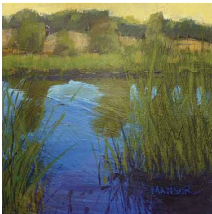
Dam Reflections , acrylic on board, 6 x 6"