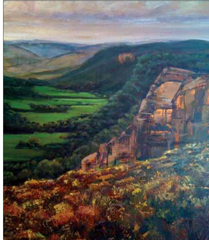
STAGE 7 Putting in some more detail in the foreground (using my credit card) to make it pop!