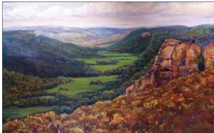
STAGE 6 Getting the sharp light on the craggy rocks contrasting with the smooth valley and distant hills below, and adding the rest of the sky.