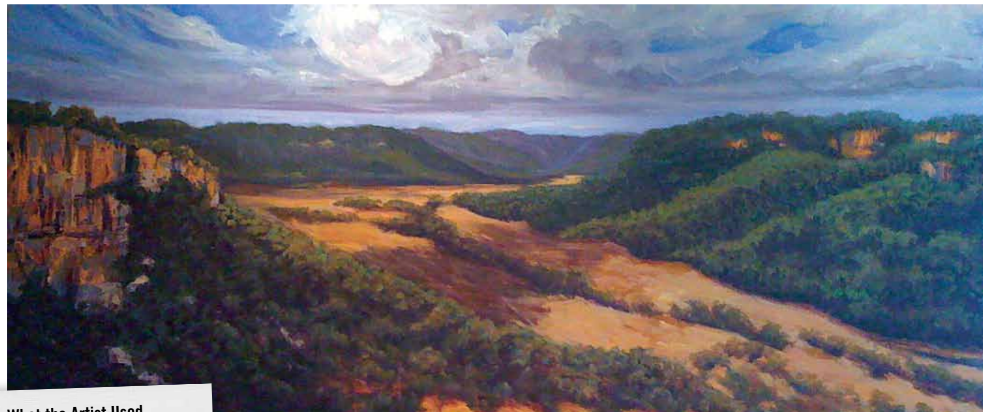
my art in the making Two Wolgan Valley Panoramas

Selecting a semi-limited palette of colours is the key to creating colour harmony. I like to use a warm and a cool of each primary plus White, Burnt Sienna and Yellow Ochre for earth tones and one or two darks like Dioxazine Purple or Raw Umber to deepen the range of darks. Using a limited palette is a great way to ensure that you are keeping in line with your colour theme/mood and the added benefit is learning how to mix paint quickly and beginning to understand which colours you need to mix to get the desired effects. From these colours I can mix just about any colour needed. □