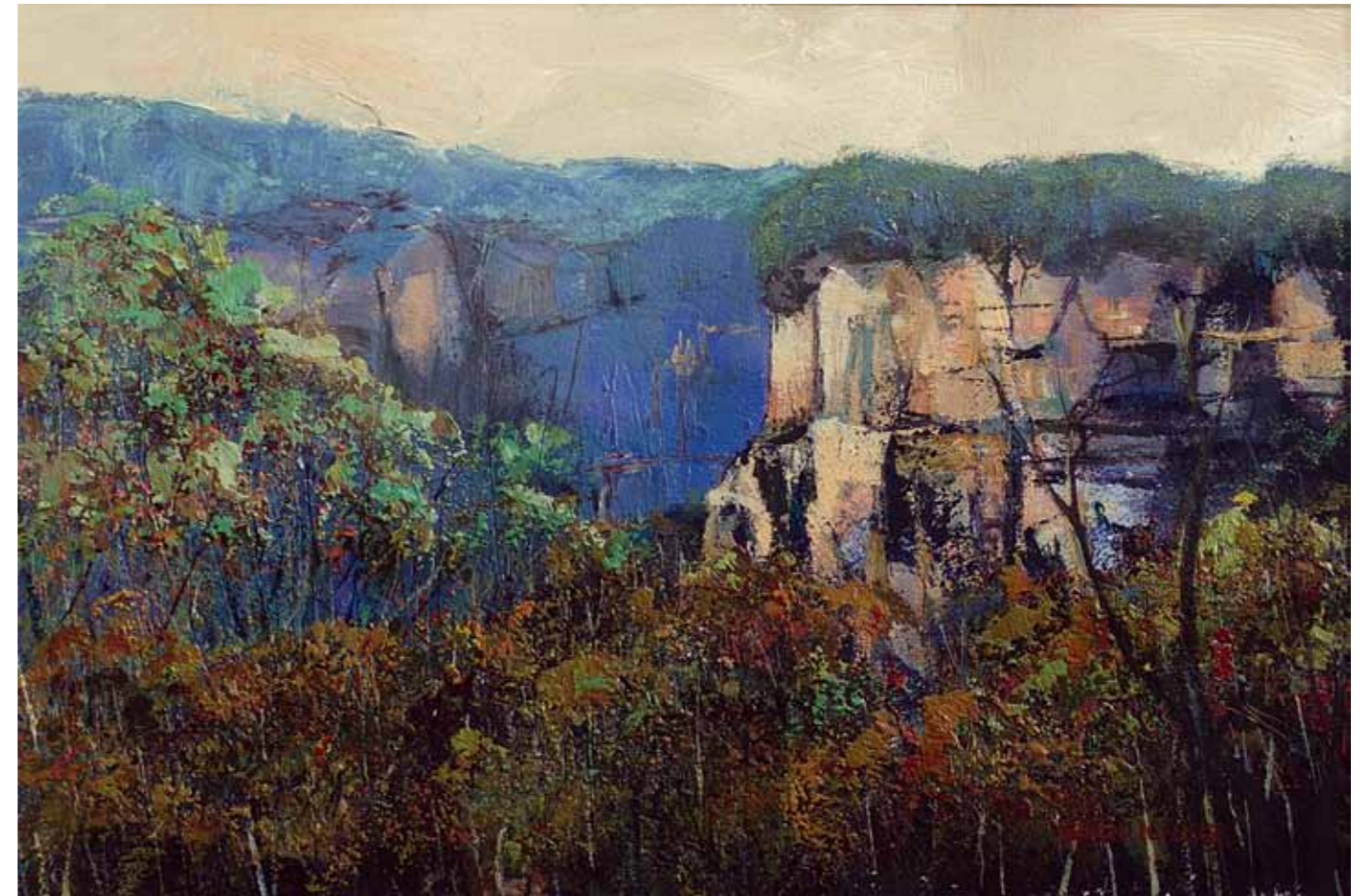
Blue Mountains Rockface I , acrylic on watercolour paper, half sheet