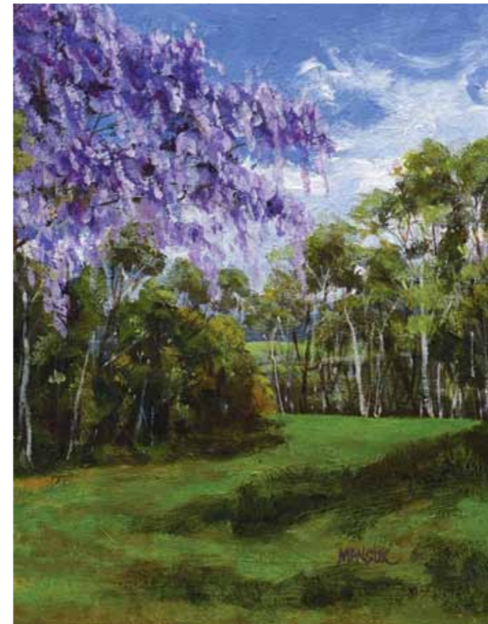
Georgia's Wisteria , acrylic on canvas panel, 11 x 14"

“ Designing a landscape is just as important as it is in a still life or figurative work. ”