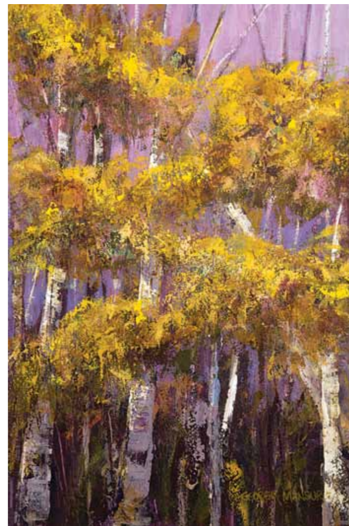
Golden Trees , acrylic on watercolour paper, full sheet