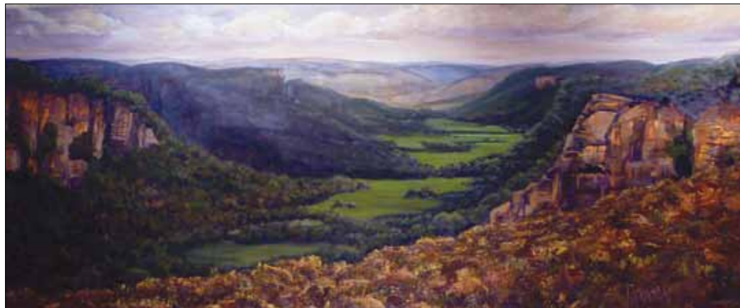
STAGE 8 Finished painting Wolgan Valley Panorama II , acrylic on stretched canvas, 33 x78"