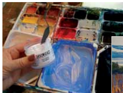
Adding Golden Gel Matte to create more impasto effects in my work