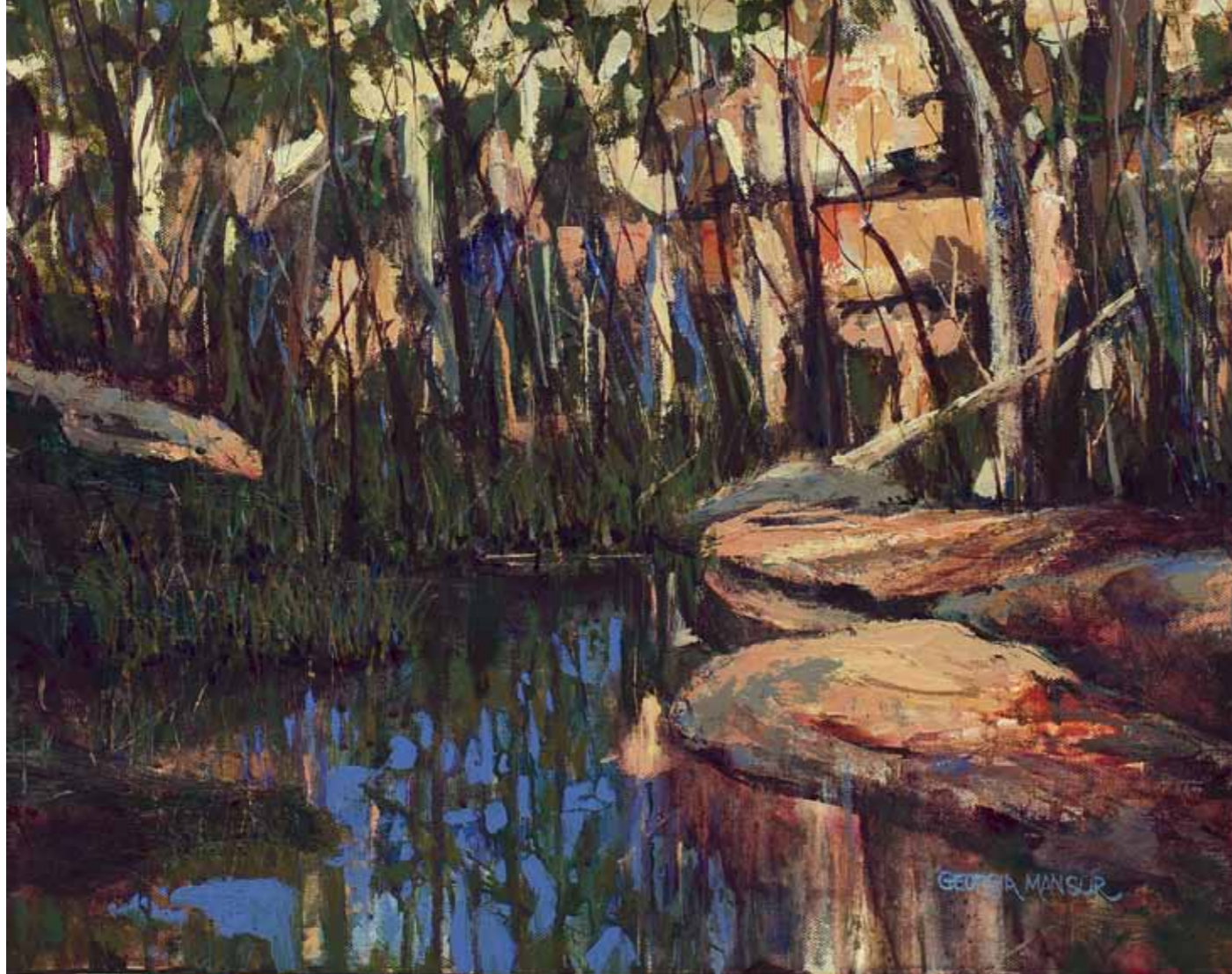
The Reflecting Pond , acrylic on stretched canvas, 20 x 20"