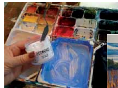
Adding Golden Gel Matte to create more impasto effects in my work