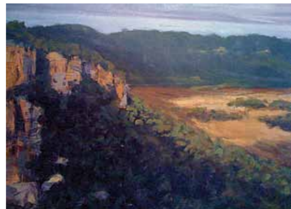
Working into the shadows