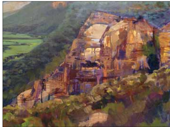
STAGE 5 Developing the rocky area on the left side, and on the right side.