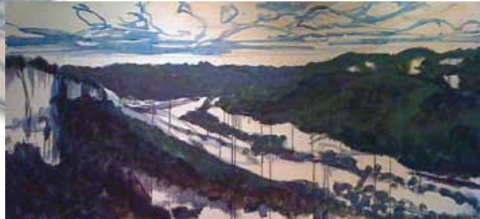
Laying in the Darks

Next, I start mapping out with a washy mix of Golden Fluids in Phthalo Blue. The reason I use Fluids for these early stages is because it dries quickly and lets me lay down the bones and get on to the meat of the painting, without delay for drying time. The intensity of pure pigment and no added fillers ensures I only need to add a few drops to clean water to create a large pool of juicy paint.