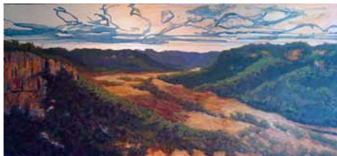
Putting in some more information